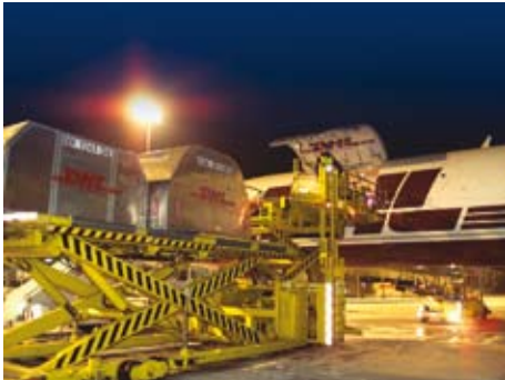
Shipment by airfreight

Your agreed payment terms are also valid for orders via SECOS. As a further service and in order to speed up the delivery process, it is also possible to pay by credit card.